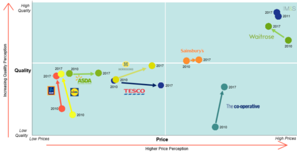
Figure 2: CMA, “Anticipated merger between J Sainsbury PLC and Asda Group Ltd: Final Report”